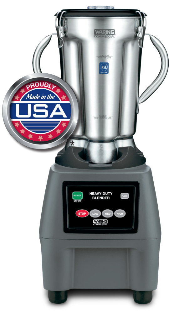
*Made in USA with US and foreign parts.