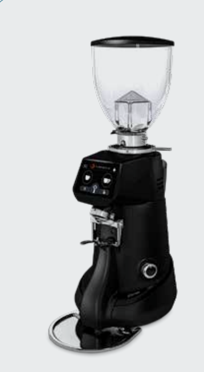
F71 EK XGi With 71-mm conical burrs and 850-Watt power.

In the sector of electric grinder-dosers for coffee shops and restaurants, the XGi line represents the very best of state-of-the-art Fiorenzato technology . Thanks to a patent held by the company , precision, efficiency and ease of use are the real hallmark of all XGi models. Its secret? With XGi grinder-dosers, the amount of coffee dispensed – calculated in grams and set one time only – remains constant , thereby ensuring precise dosing, preventing waste and offering a perfect cup of coffee every time. In addition, the range is available in the Pro version, with a grinding chamber that can be easily and quickly removed, to facilitate cleaning and maintenance operations.