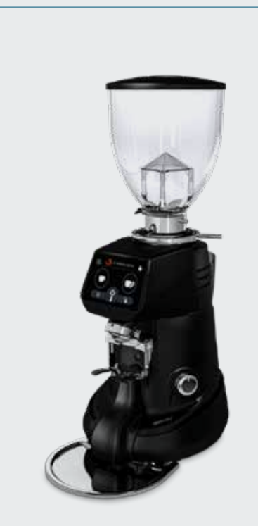
F64 EVO XGi With 64-mm flat burrs and 350-Watt power.