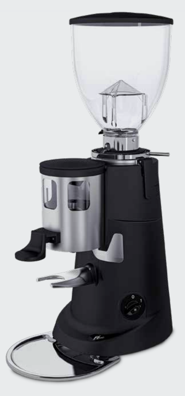
NOTE: Model A = with microswitch for automatic doser filling