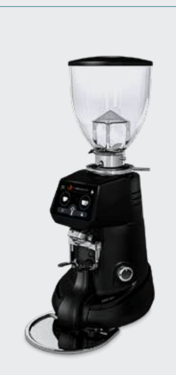
F64 E XGi With 64-mm flat burrs and 350-Watt power.