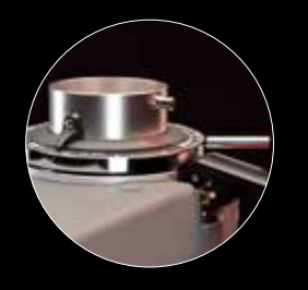
Easily detachable grinding chamber