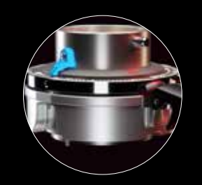
No grinding point setting variation