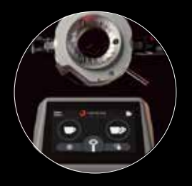
Up to 50% less coffee retention