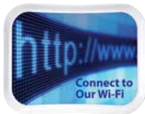
Create one announcing a service for customers.