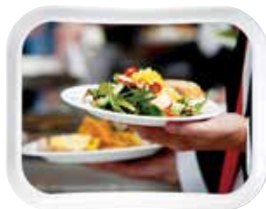
Create one with a beauty shot.