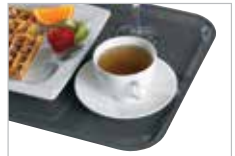
Laminated Capri Trays