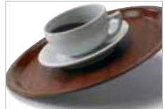
Laminated Mykonos Trays