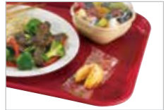
Fast Food Trays