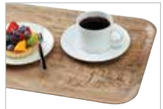
Laminated Madeira Trays