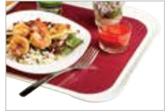
Polyester Century Fun Trays