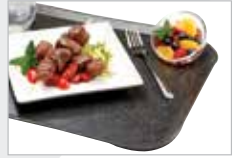
Versa Trays Eco Green

All Cambro trays are submitted to an array of tests described on the following page. The results are indicated on each tray page under Technical Test Results.