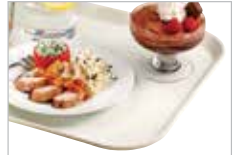
Versa Lite Trays