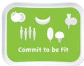
Create one with a helpful message.