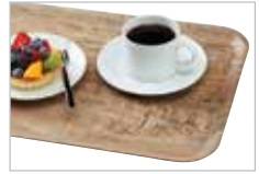
Laminated Madeira Trays