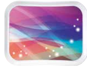
Create one with your imagination.

Other sizes are available. Contact our customer service for more information.