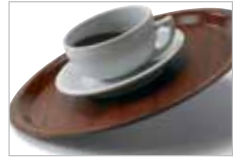
Laminated Mykonos Trays