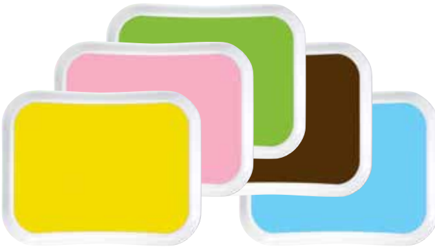
Create your own colour.