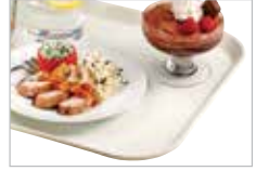
Versa Lite Trays