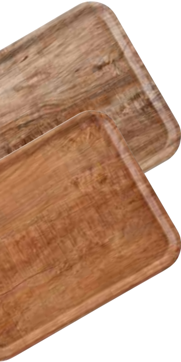
Light Olive (E89)