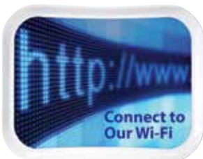
Create one announcing a service for customers.