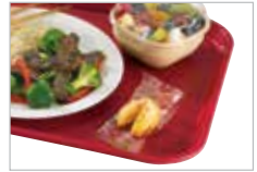
Fast Food Trays