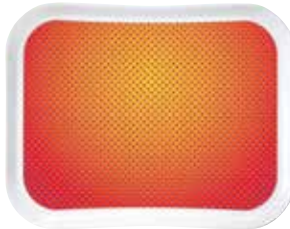
Create a pattern design.