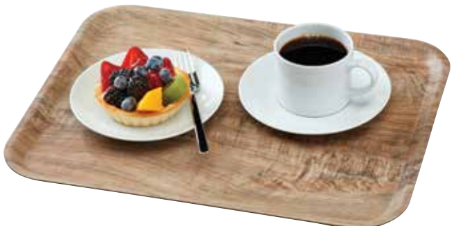
Brown Olive (E90)