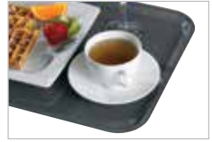
Laminated Capri Trays