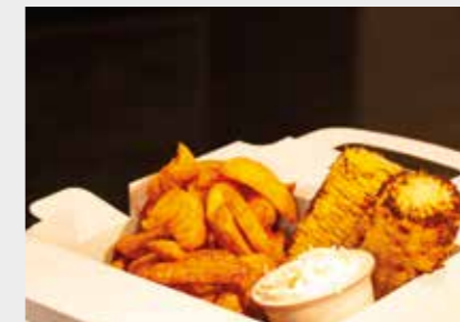
French fries Cooking method: Convection 18 kg in 18 minutes