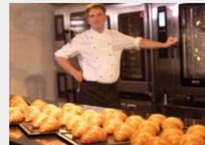
Croissants (70g) Cooking method: BakePro 80 pieces in 19.5 minutes