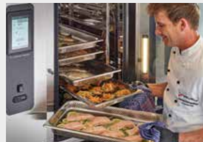
Poached fillet of salmon Cooking method: Combi-steam 20 kg in 28 minutes