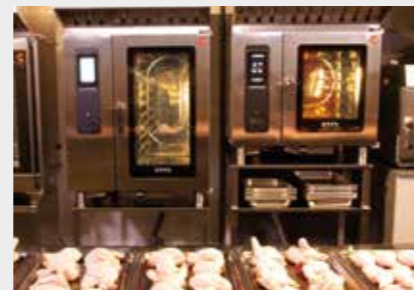
Chicken on the Bone Cooking method: Crisp&Tasty 22 kg in 30 minutes