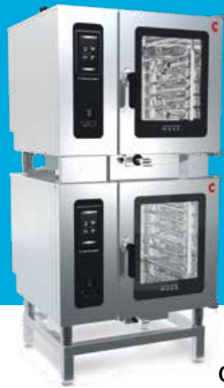
Quantities in a Convotherm maxx 10.10: