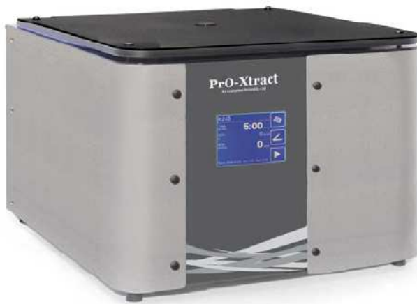
Display indicative only