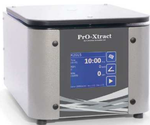
Display indicative only