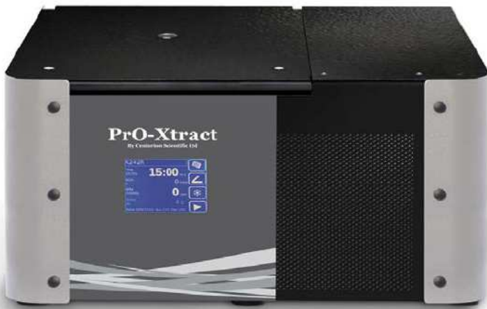
Display indicative only