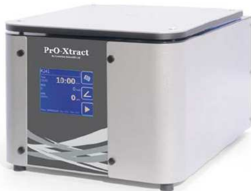
Display indicative only