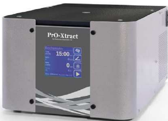
Display indicative only