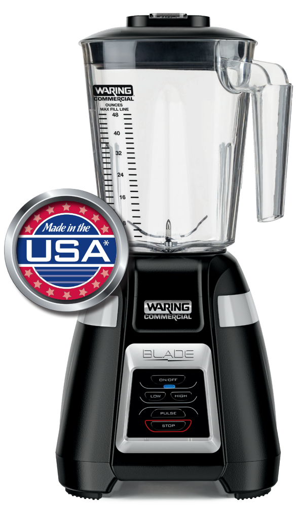
*Made in USA with US and foreign parts.