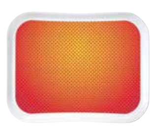
Create a pattern design.