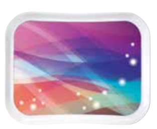
Create one with your imagination.