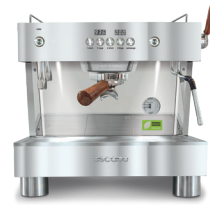
1GR Full Inox