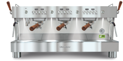
3GR Full Inox