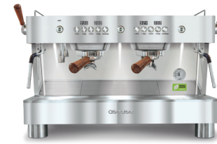
2GR Full Inox