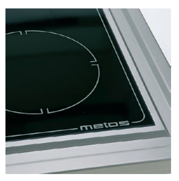
In the combi model Ardox IEC the induction cooking zones are square and infrared zones round.