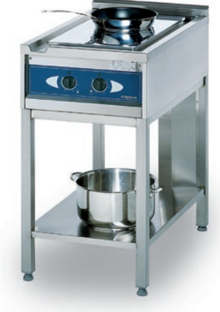
Metos Ardox S2