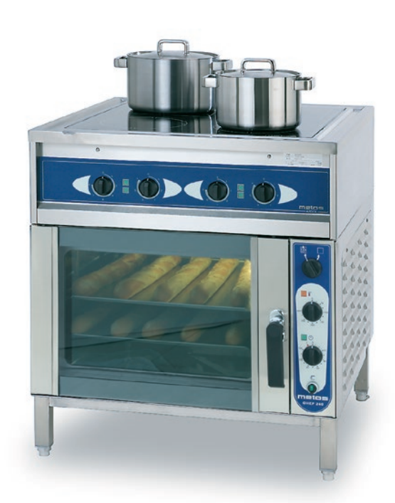
Metos Ardox C 4 with convection oven in the stand.

All the Ardox IE, IEC and C ranges are similar in dimensions and looks. All have the depth of 800mm and height of 900mm. The widths are 500mm (2 zones), 800mm (4 zones) and 1200mm (6 zones). The 2 and 4 zone models have one glass plate, whereas the 6 zone model has two separate glass plates. All have a groove round the glass plate to collect any spillage or cleaning water.