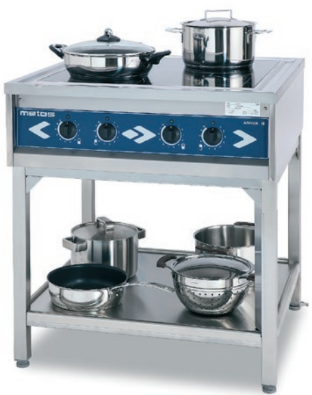
Metos Ardox IE 4