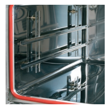
The Ardox C range is available with Metos Chef oven in the stand.