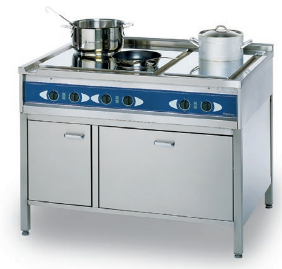
Metos Ardox S6 DB with a cabinet and drawer (on the right)