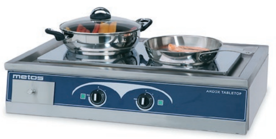
Metos Ardox S Tabletop

Ardox S Tabletop serves as a flexible way of adding cooking capacity. The range has a hard chrome top and a gutter and drawer for boil-overs. Takes only 800 x 510 mm table top