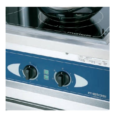
Ardox glass ceramic range panel