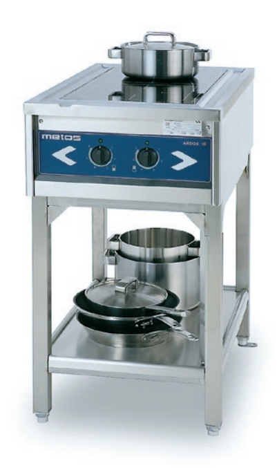
Metos Ardox I 2

All the Ardox IE, IEC and C ranges are similar in dimensions and looks. All have the depth of 800mm and height of 900mm. The widths are 500mm (2 zones), 800mm (4 zones) and 1200mm (6 zones). The 2 and 4 zone models have one glass plate, whereas the 6 zone model has two separate glass plates. All have a groove round the glass plate to collect any spillage or cleaning water.