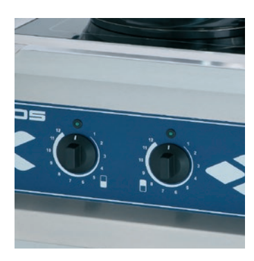
Ardox induction range panel