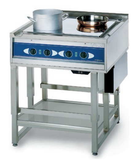
Metos Ardox S4 H with height-adjustable stand

The edges around the range are the same height as the cooking zones. The six zone model has separate two and four section chrome-surfaced stainless cookings tops. You can also order optional side shelves which makes serving easier and allow you to shift pans conveniently over the edge of the range with no risk of tipping. The flat range top makes cleaning quick and easy, and there is even a gutter between the top and the edge to funnel boil-overs and cleaning water. There is also a splash and splatter profile at the back of the range to prevent food matter from getting behind the range.