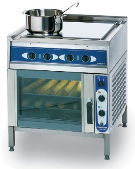
Metos Ardox S4/240 with Metos Chef 240 convection oven in the stand