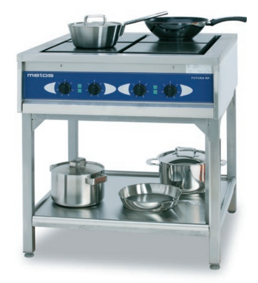
Metos Futura RP range with cast iron hotplates