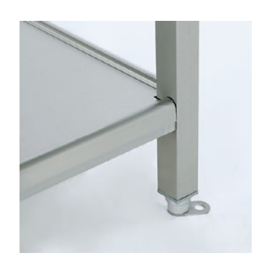
The open stand has one shelf with rounded edges. In the back legs there are bolt holes for sturdy installation.