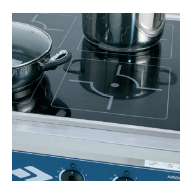
Ardox induction range surface is glass ceramics and cooking zones are square

Metos Ardox IEC is a product concept that combines the benefits of induction to a reasonable price level and the possibility to carry on using old cookware that is not induction compatible. The Ardox IEC has two induction cooking zones and two round infrared cooking zones