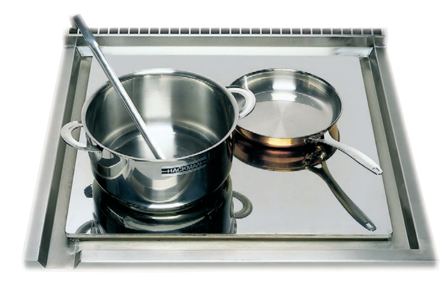
Besides using the temperature control dial, you can regulate cooking temperature by shifting pans between the cooking zones. The flat chrome surfacing prevents heat radiation and thus saves energy.