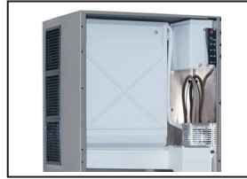
Vertical Cube System