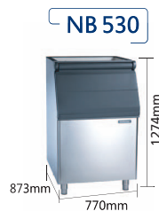
Storage Capacity: 243 kg