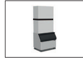
Double Stack (Needs a stacking kit sold separately)