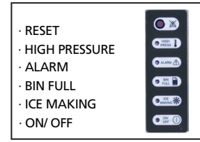
Auto-alert Indicator Lights