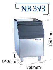
Storage Capacity: 178 kg