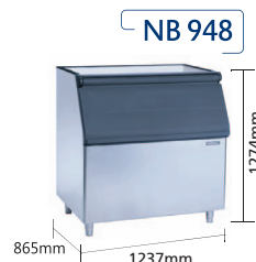
Storage Capacity: 406 kg