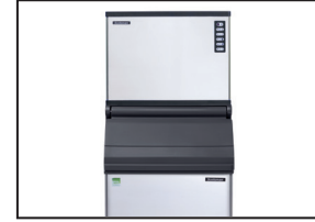
T304 Stainless Steel Panels