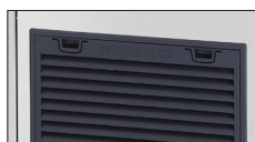
Removable and cleanable air filter