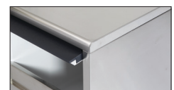
Disappearing insulated door