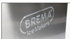
AISI 304 SS Scotch Brite finish