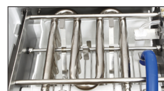
FDA approved - ABS water basin